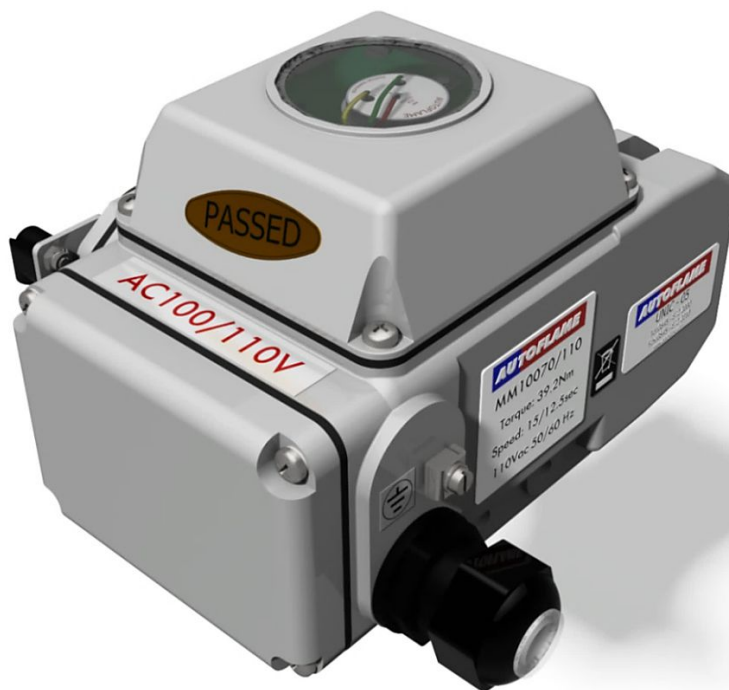
Industrial Servo Motor