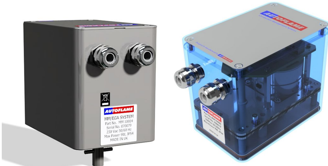
Large Servo Motor